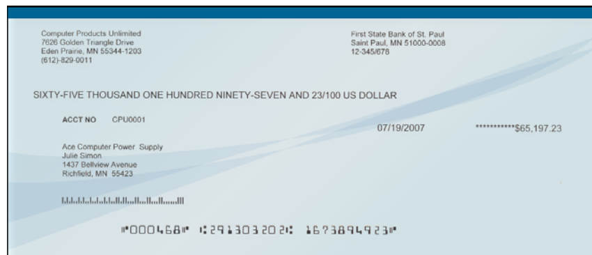
The MICR line on a check allows the check information to be automatically read for quicker processing.

The Reconciliation Import in TRAVERSE Banking enables you to use files downloaded from your bank to automatically clear transactions that have been processed by the bank, a great time-saver.